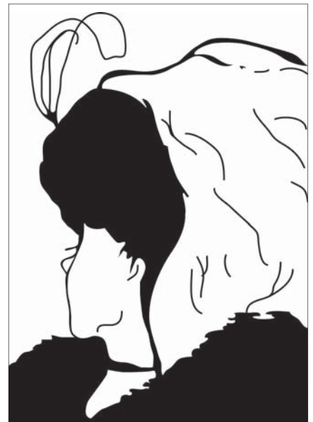
Figure 1. Told to look at the old woman’s large nose on the left, we tend to see only the old woman. Told to look at the young woman’s chin on the left, we tend to see only the young woman. In either case it can even be difficult to get our brains to switch to the other. This illustrates the power of suggestion or preconceptions. The picture also illustrates how one scientist looks at the data and sees an old earth, while another looks at the same data and sees a young earth. < www.grand-illusions.com/woman.htm >

This is a convenient re-characterization of the days, but it hardly cooperates with the author! 2